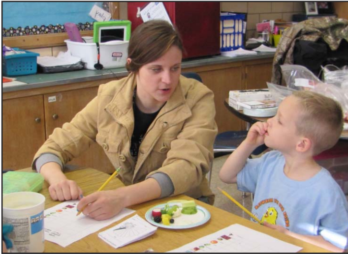
[Pictured above and below] Business classes with FBLA members at Grand River Technical School working one-on one with kindergarteners as part of the SAFETY SMART® program.