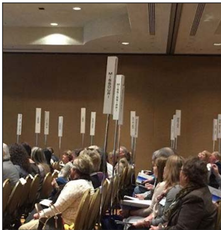
↑ Missouri ACTE delegates attend the ACTE Vision 2014 held in Nashville last November.

Source: News-Press; December 17, 2014; 5:00 p.m.